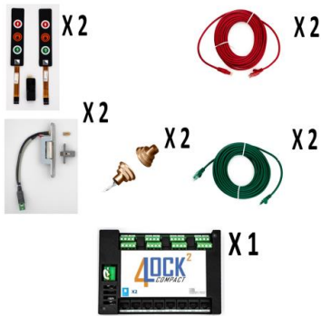
15KIT00020 two doors