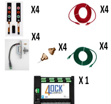
15KIT00020 four doors

PLEASE NOTE: Semaphore indicators central button operates as doors unlock.