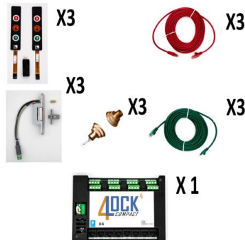
15KIT00020 three doors