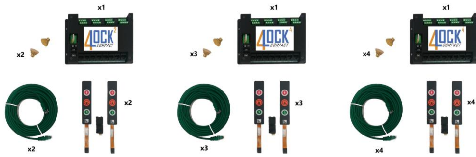
15KIT00041 two doors